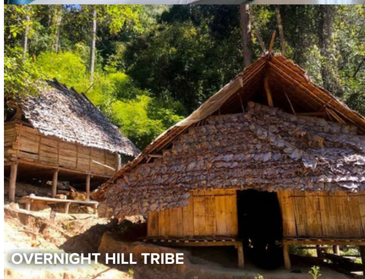
OVERNIGHT HILL TRIBE