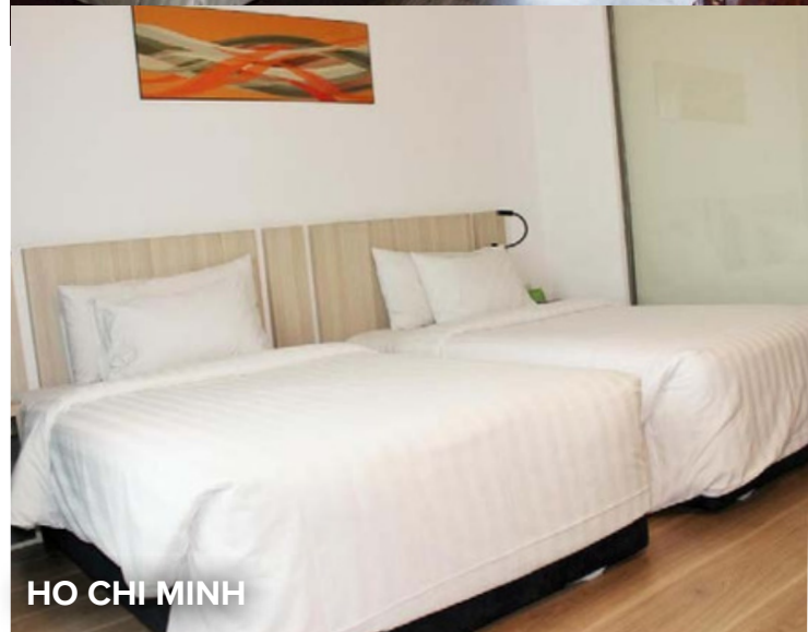
HO CHI MINH